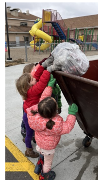
Earth Day clean up

"Let everything that has breath praise the Lord!" — Psalms 150:6