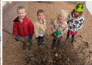
Discovering ↑ duck eggs!