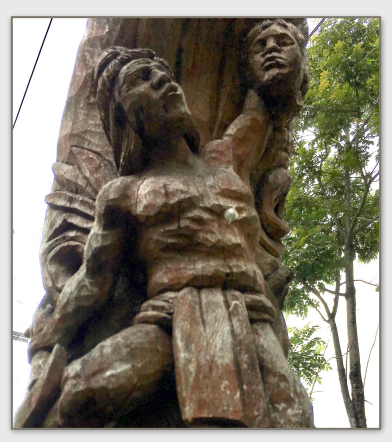
For love, not for a temp agency! (Panagbenga Park, Baguio, Philippines)